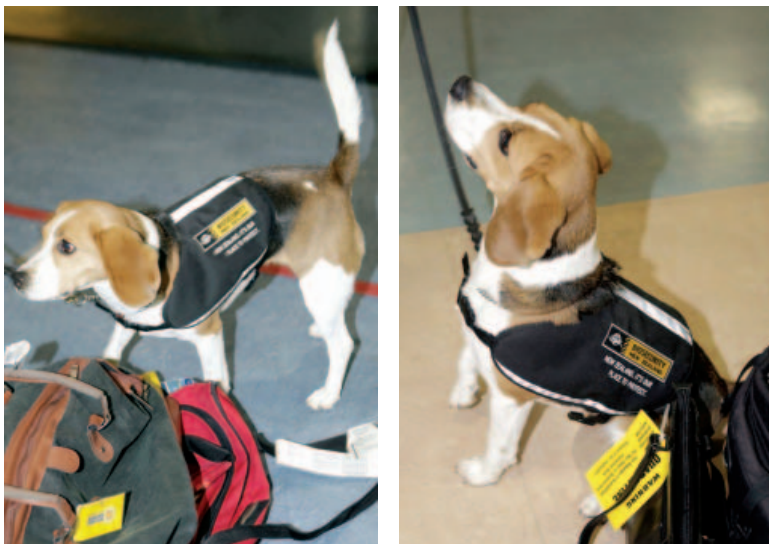
Far left: Stylish beagle Piper shows off her new uniform as she works hard to protect New Zealand's border at Auckland Airport.